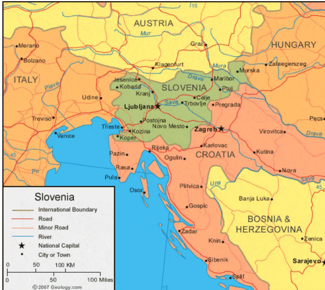
Slovenia's Place in Europe

A few words about Slovenia itself: it is a small country located in southern central Europe at the intersection of major trade routes and of the Slavic, Germanic, and Romance languages and cultures. Historically part of many empires including Rome, Austro-Hungarian, Venice, and France, it is currently a prosperous, democratic European country of two million persons. Over 50% of its landmass remains forested. It is exceptionally bio-diverse for its size particularly as pertains to endemic cave species.