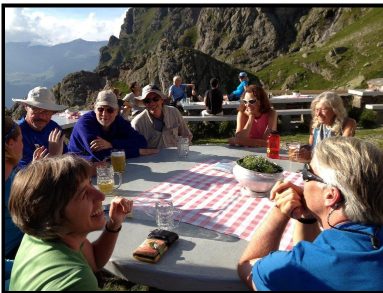
Relaxing together after a great day on the trail

When you participate in this activity, you should be in proper condition for the challenges outlined in this prospectus and equipped with appropriate gear. You should always be aware of the risks involved and conduct yourself accordingly. You are ultimately responsible for your own safety. Prior to your acceptance as a participant in this trip, you will be asked to discuss your capabilities and experience with us. We may also request references to confirm your fitness level and suitability for participating in trip activities. Please do not be offended by our questions.