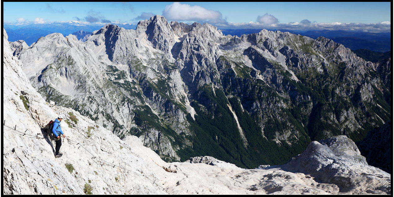
Climbing Mt Triglav using the via ferrata