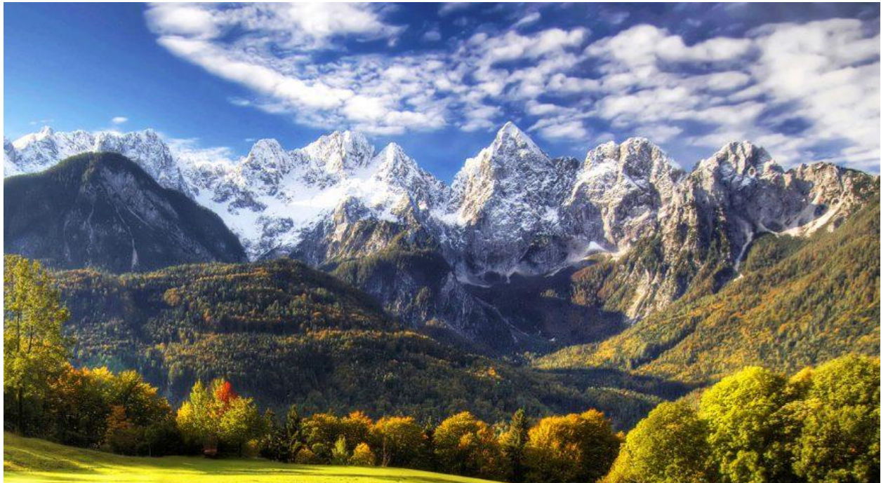
Triglav National Park

July 9, 2022 – July 23, 2022 (trip# 2211)