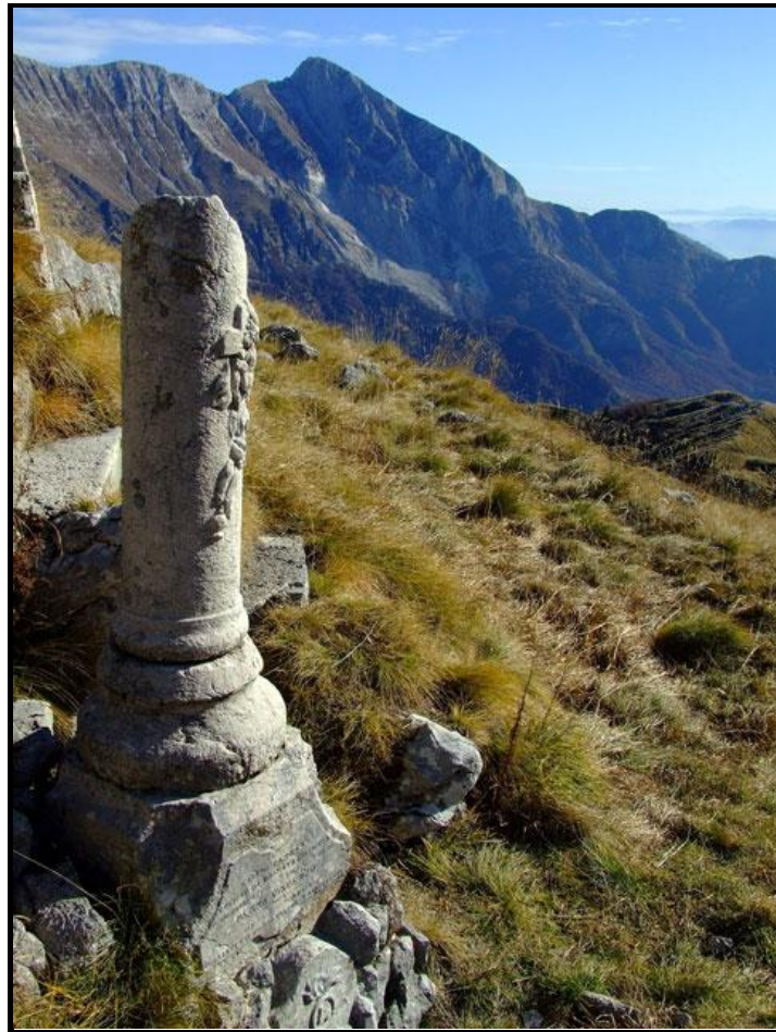
World War I Memorial near Dreznica

Today's hike continues on the Path of Peace, with stunning scenery of the Western Slovenian Alps, and passes by more outdoor museums and numerous chapels. We will hike to the little village of Dreznica, set high above the Isonzo valley. Heavy fighting took place in this area during WW1. Following our hike we will be transferred to the nearby town of Kobarid where we stay in a hotel. If there is time, we will visit the small military museum with its collection of war memorabilia and the nearby Napoleon Bridge with views of the mountains and Soča River. Ascent: 440 ft.; descent 3250 ft.; 13 miles. Approximately 6 ½ hours walking.