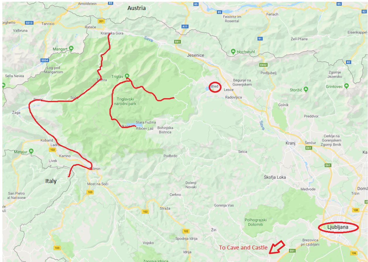
Map of the Region of Slovenia showing our sites and trekking routes