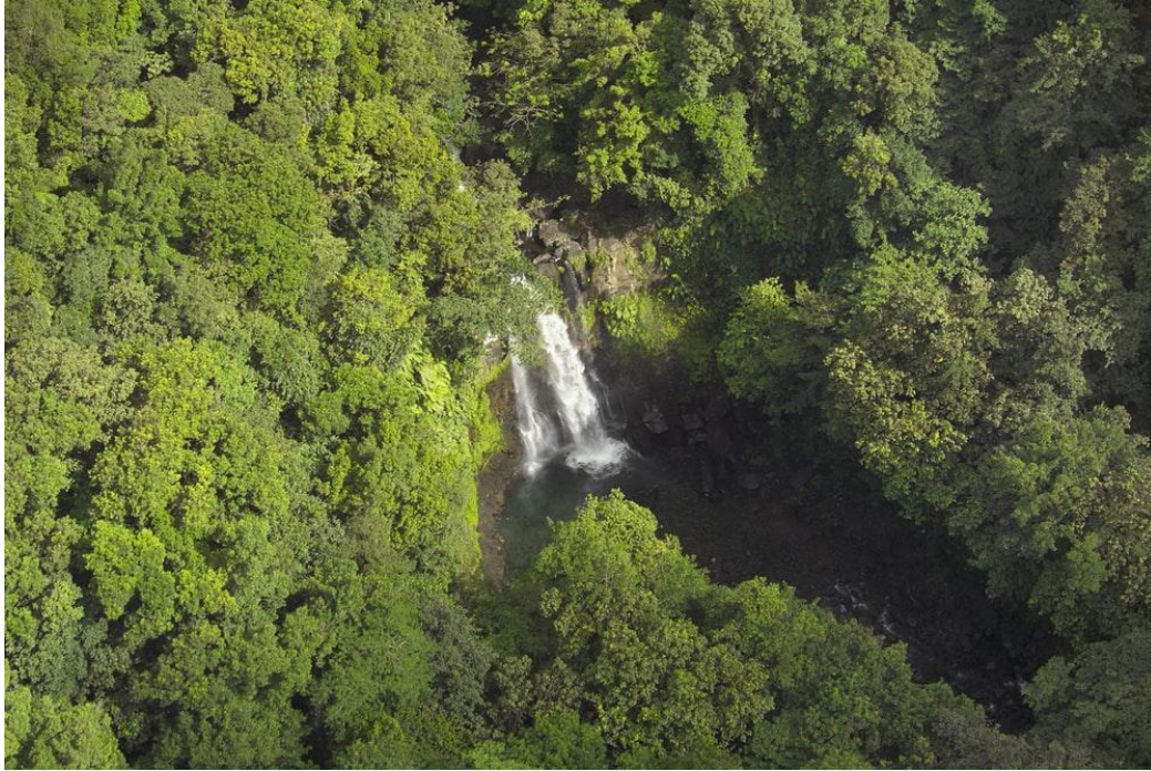
Waterfalls at Basse-Terre.