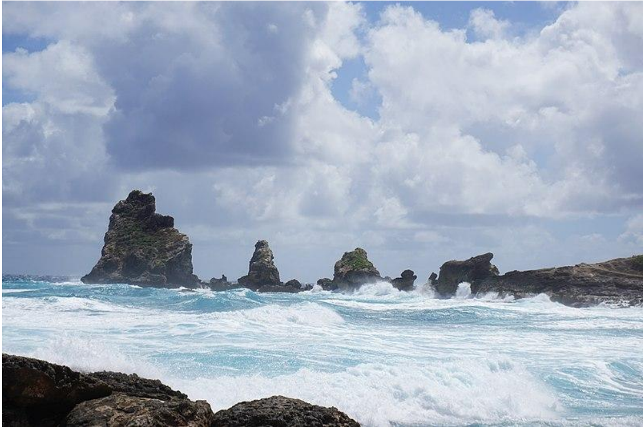
Pointe des Châteaux. TroisRivières

Day 5, Fri., Dec. 30: We plan to hike the picturesque coast trail, Pointe des Châteaux trail (~6.8 mi, ~425 ft elevation gain, 4-5 hours). The afternoon and evening will be free for participants to enjoy the beach or explore the area, and visit a local restaurant for dinner. (Breakfast included.)