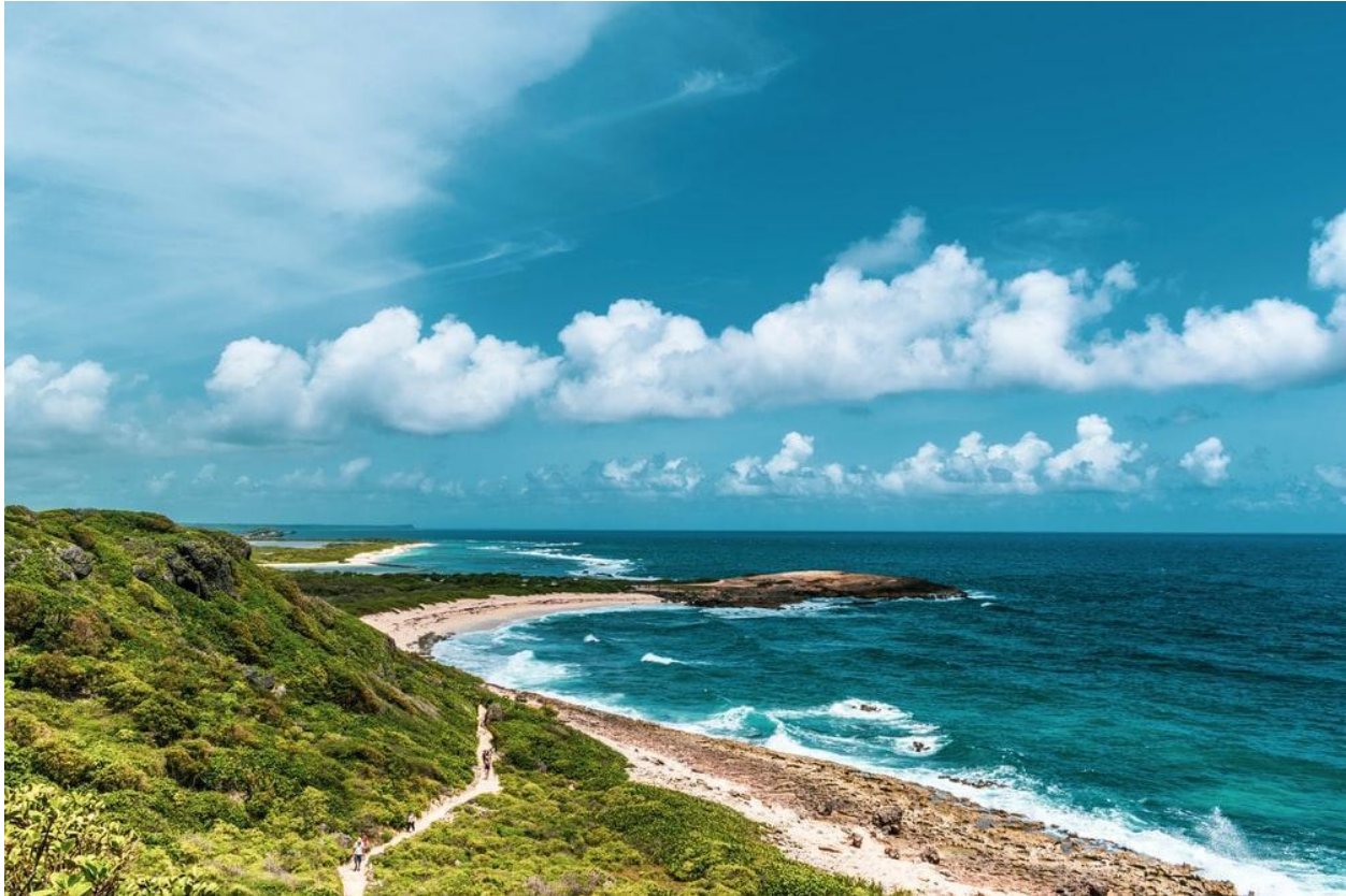
Pointe des Chateaux.