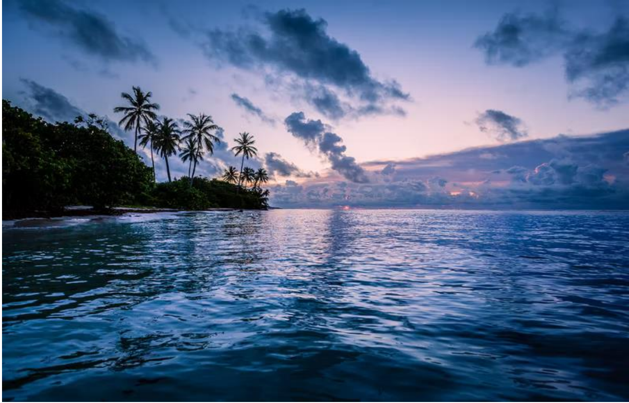
Sunrise in Guadeloupe.

participant will be accepted, and subsequently the participant's check will be deposited, if the trip leaders have determined the participant and trip are a good match, and the trip is confirmed.