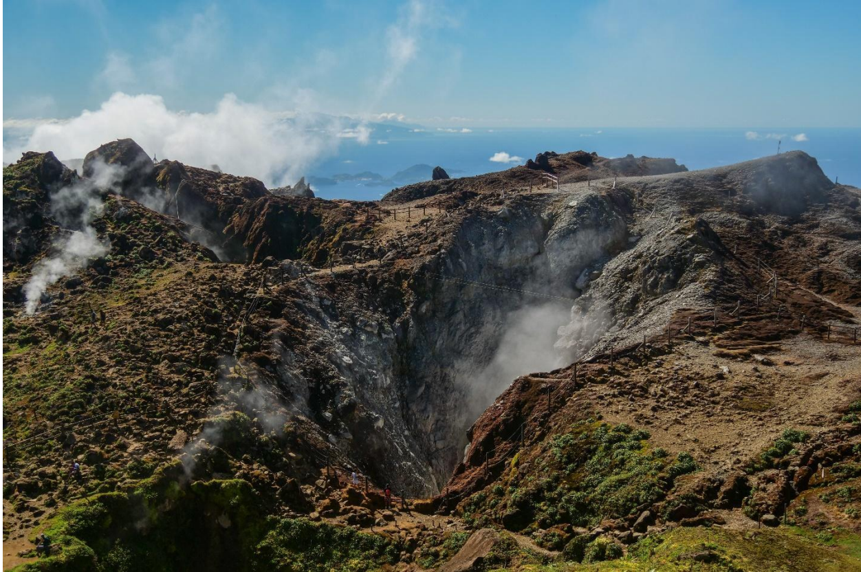
Eruptive mouths and chasms releasing fumaroles on La Soufrière.

their cooperative efforts, and the expectation is all participants will be considerate of others sharing in this AMC Adventure Travel experience.