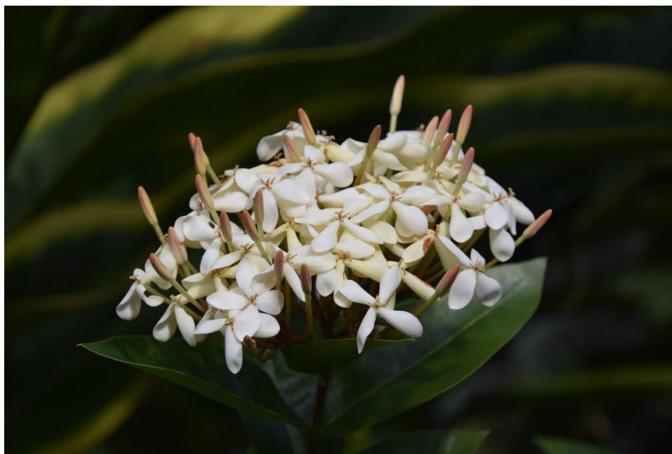
White jasmine flower at Jardin Botanique.