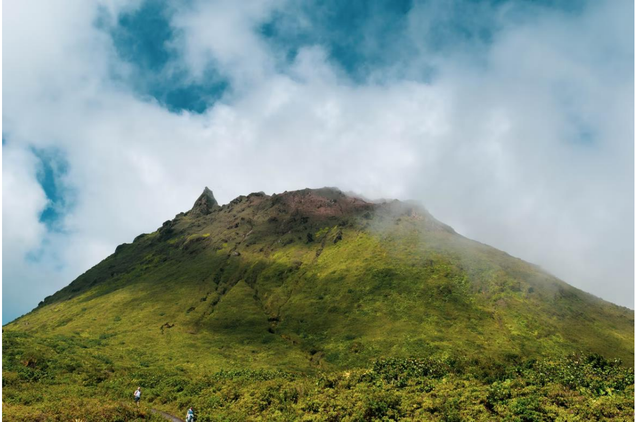
La Soufriere volcano.