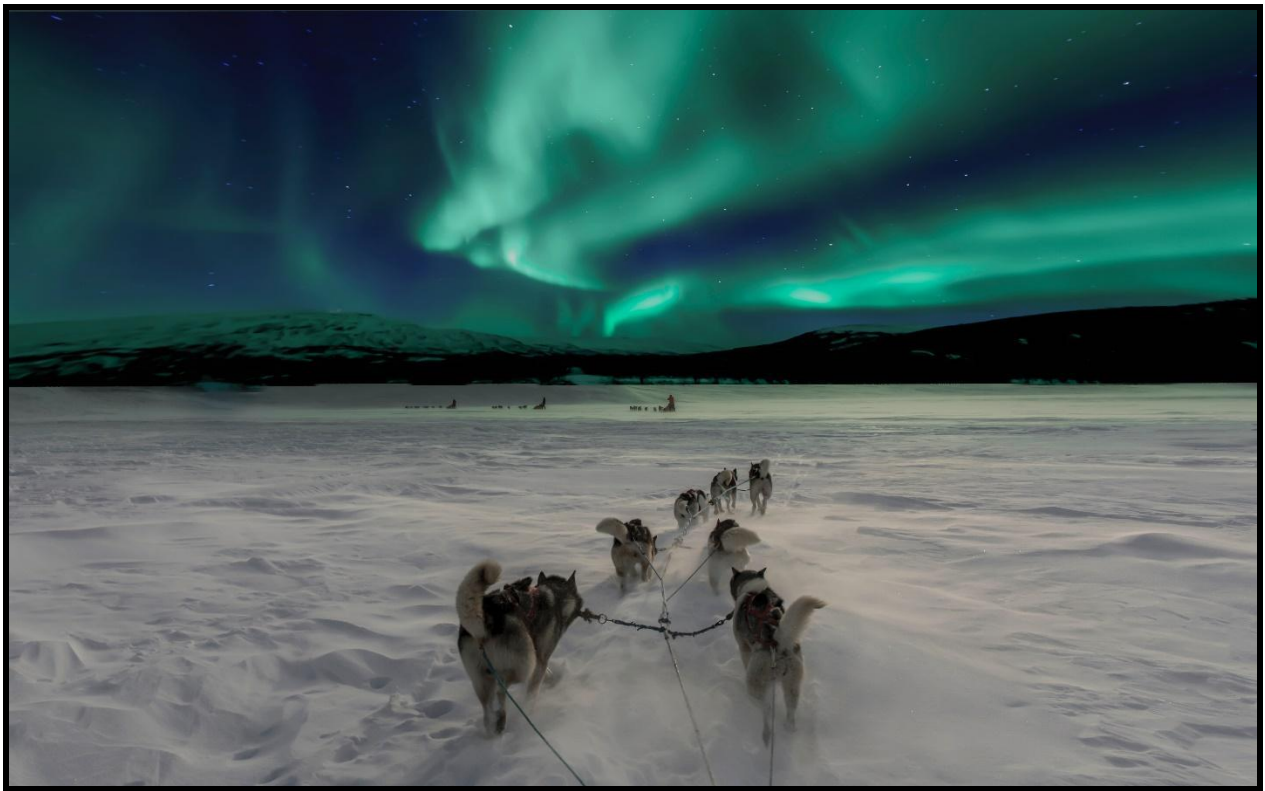
Northern Nights

March 13, 2023 – March 23, 2023 (trip# 2317)