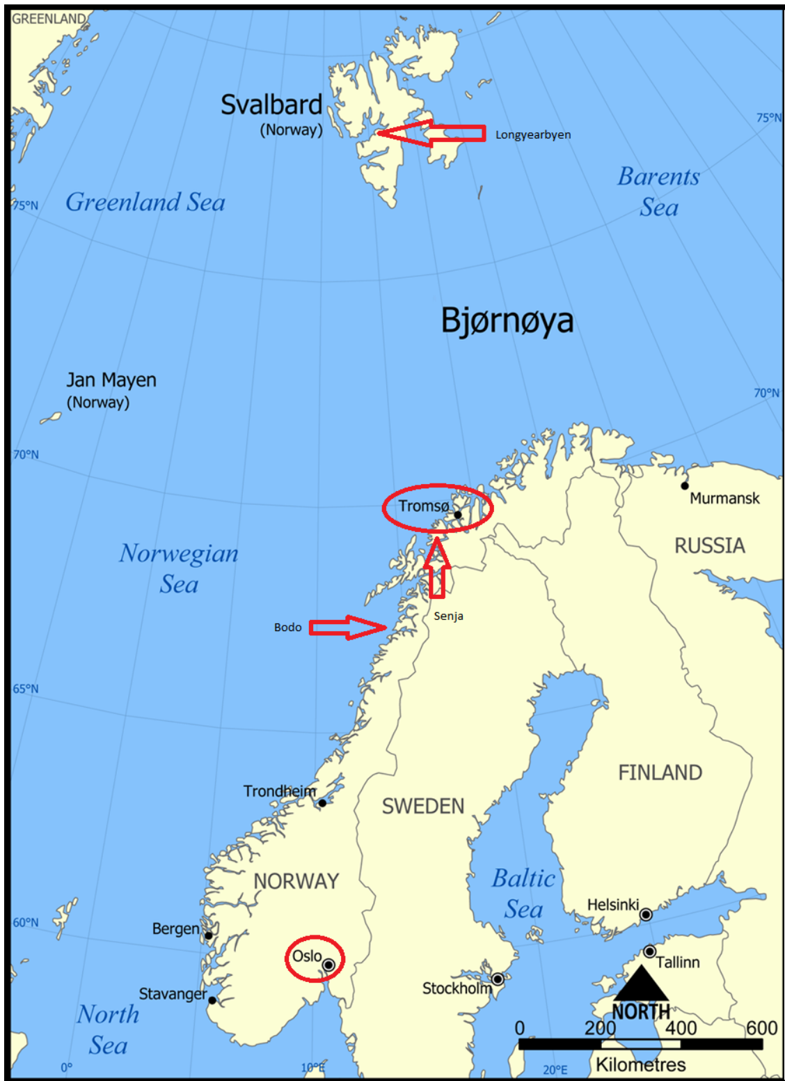
Map of Norway showing some of the places we will visit