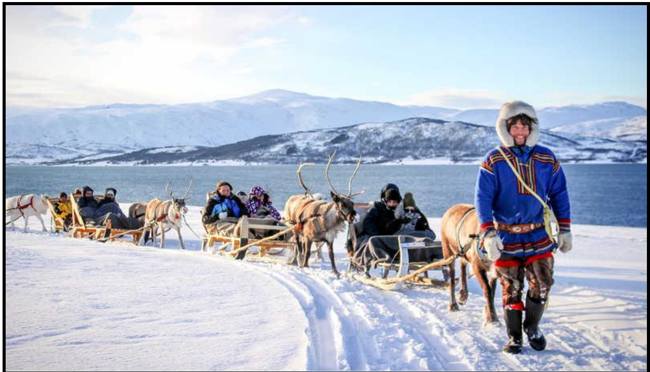
Reindeer Sledding With Sami Guide

At 5 PM, we will be collected from the hotel for the start of a reindeer sledding and Sami culture tour. This is a thrilling way to explore Tromso in the company of an experienced Sami guide. The wilderness location has little artificial light, so conditions are ideal for seeing the Northern Lights, weather permitting. (Please note that we ride the sleds as passengers, and not as drivers!) After the reindeer sledding, we will be served a traditional hot meal and learn more about the Sami culture while seated around a warm fire in a Sami tent. Following dinner, we return to the hotel in Tromso in the late evening (approximately 10 PM). (B, D)