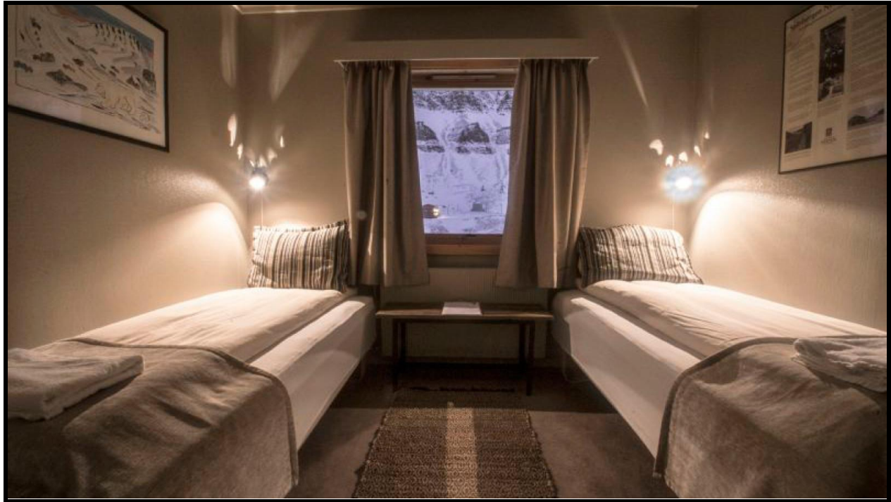
Twin Room in Miners' Cabin