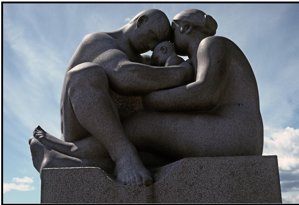
Vigeland Sculpture Park In Oslo

After your arrival in Oslo make your way to the city center and our hotel, the Clarion Hub Hotel. We suggest you take the Airport Express to Oslo Center, from where it is a very short walk to the hotel. After we get together to meet and discuss the trip, we will have a welcome dinner at our hotel. (D)