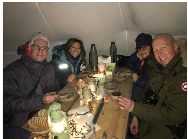
Dinner in a Sami tent

You should recognize that you may find yourself in closer quarters or be less comfortable than you are used to at home. You should make it a priority to help others on the trip and contribute to their having a great time. If you do that, you will have a great time.