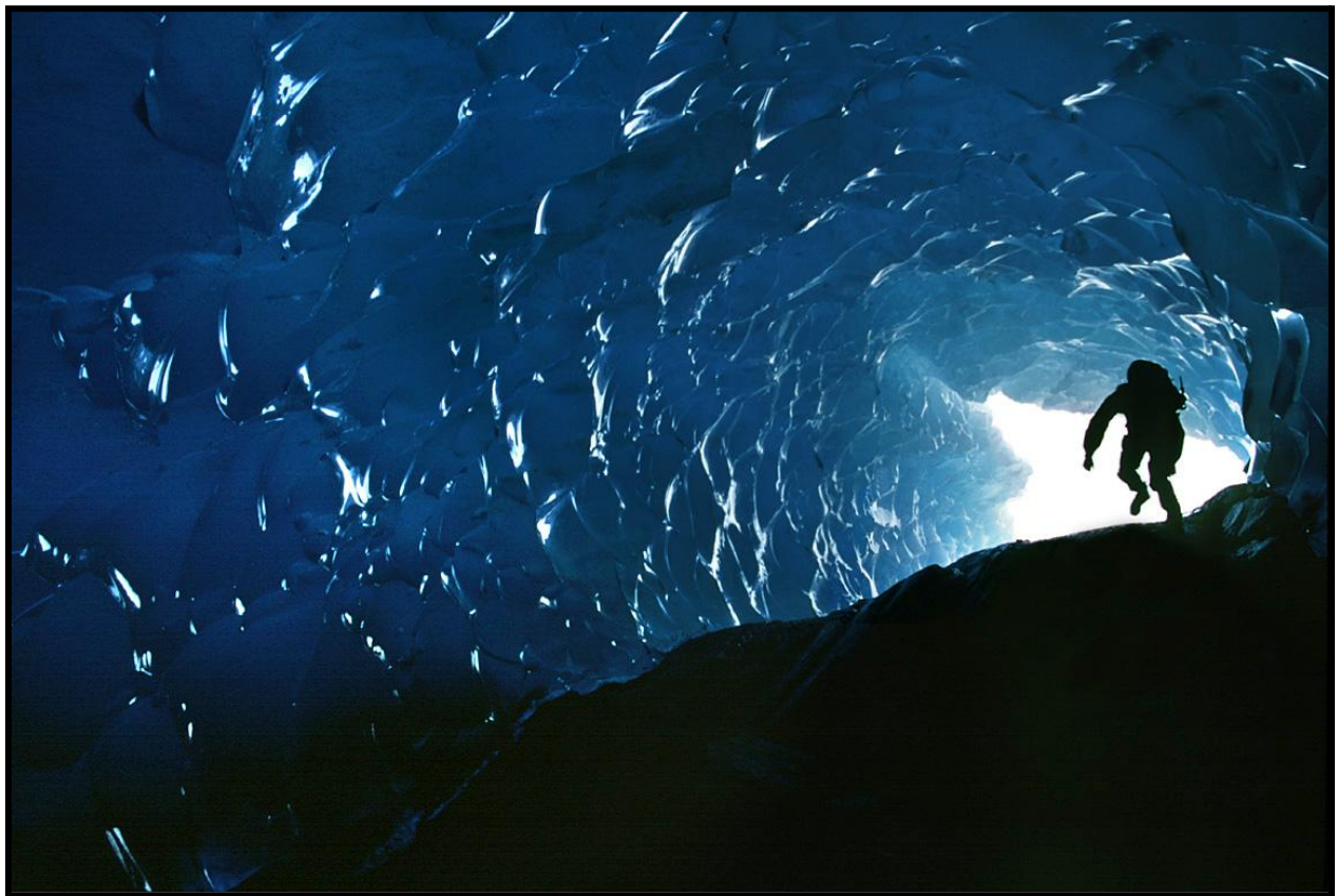
Walking Through an Ice Cave

We will be collected from the guesthouse after breakfast and driven to the dog kennels (8 miles from Longyearbyen). Once there we will be fitted for outer thermal clothes before setting off. Each sled will take two, allowing us to try riding as a passenger and also mushing. During the ride, we will stop at an ice cave within the glacier, taking an hour to explore its interior while the dogs rest. During the summer the ice cave becomes a bubbling meltwater river, while in the winter it is completely frozen over, revealing beautiful ice formations.