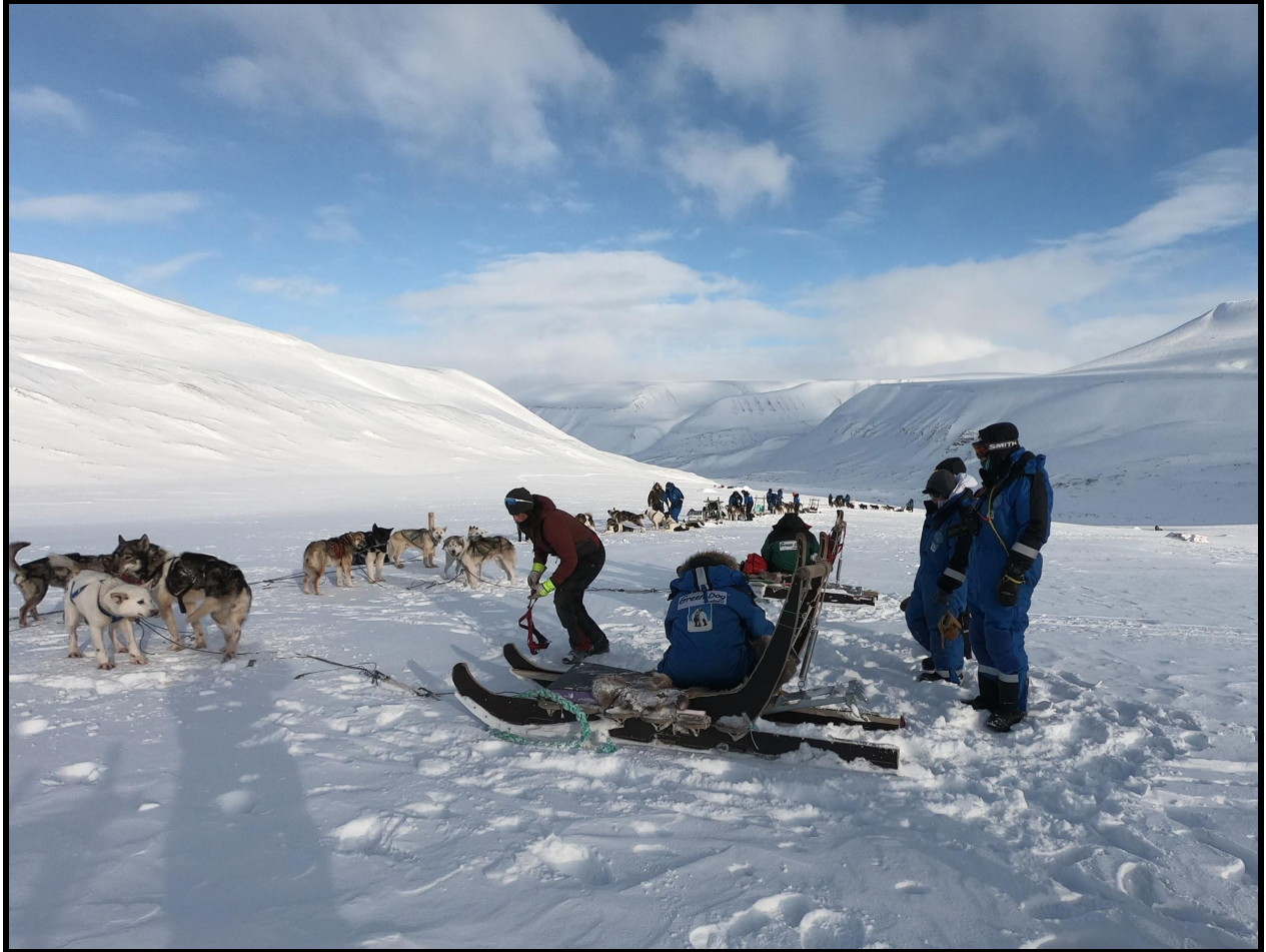
Dog Sledding In Svalbard

Return to Longyearbyen and the Miners' Cabins. Dinner is on your own. (B, L)