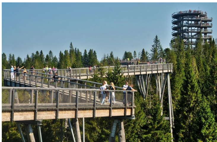
"Chodník Korunami Stromov (Treetop walk)" by young shanahan is licensed under CC BY 2.0

Today our driver will pick us up and take us across the border to Slovakia. We will start our hike in Javorina, a charming village in Poprad District in the Prešov Region. Hike to Ždiar, one of the oldest settlements in the Tatras. The culture of Goral people is evident everywhere from the gingerbread-style log buildings and the local embroidery to traditional meals, heavy with cheese. We'll visit the Bachledka Treetop walk in the heart of majestic forests of the Pieniny National Park, a long and winding pathway at the top of the forest and don't miss the view from the 32-metre-high observation tower.