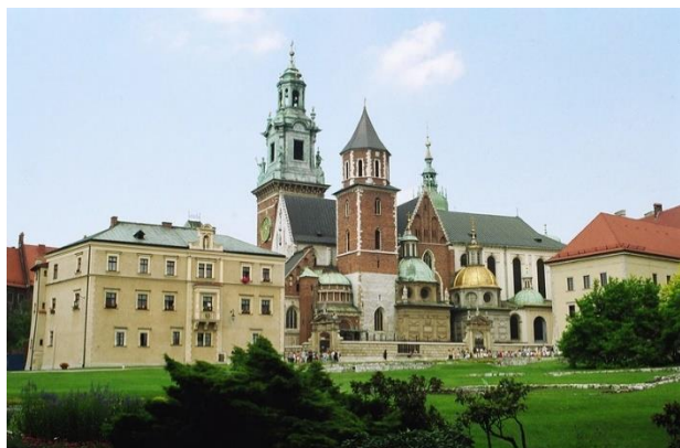
"Wawel Castle"

Today we will take a walking tour of the former residence of Polish kings and a symbol of Polish statehood. Wawel Castle, now a museum, hosts a vast collection of paintings, graphics, sculptures, fabrics, goldsmiths, military items, porcelain, and furniture. After the tour we will have a traditional Polish lunch before we head off to the town of Wieliczka to explore the Salt Mine. At 700 years old, we will explore the underground church, sculptures, carvings and even an underground lake. Tour time – 7 ½ hours