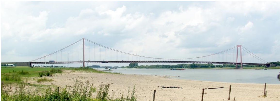
Golden Gate on the Lower Rhine. Raimond Spekking

We will enjoy the evening in the old Hanseatic town of Emmerich on the beautiful Rhine promenade, which invites us to stroll.