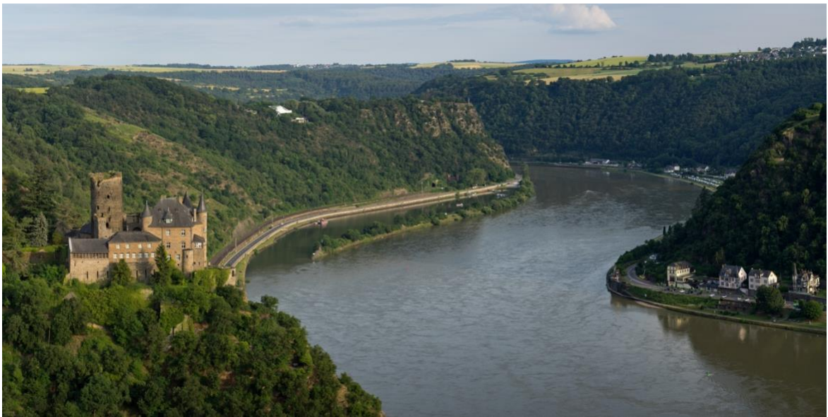
Katz Castle on the Rhine River, Germany, leading towards Lorelei rock at the bend.