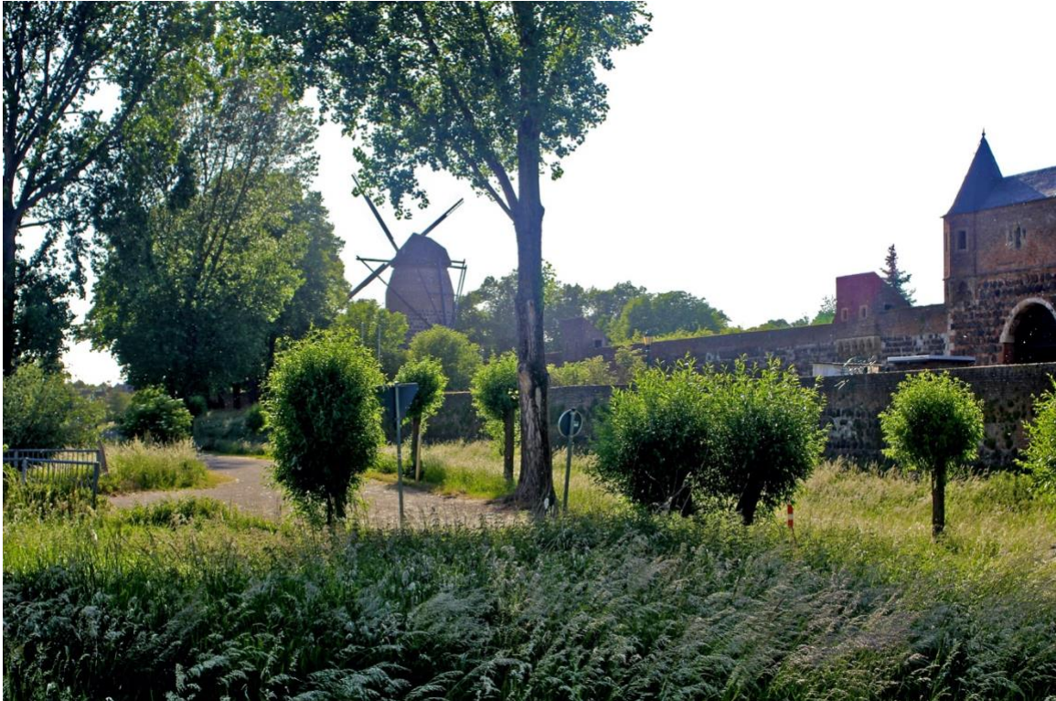
Medieval town on the Rhine. Zons am Rhein .

On the Rhine Cycle Path, we will cycle comfortably to Düsseldorf's old town, which is also known as 'the longest bar in the world'. This expression of cheerful Rhenish nature stands for more than 250 pubs, restaurants and bars that line the streets of the old town. We will relax at Burgplatz, which has been voted one of the most beautiful squares in Germany and enjoy the wonderful view of the Rhine.